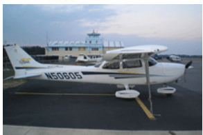
✈ Flight Training Center